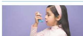
Allergies and Asthma